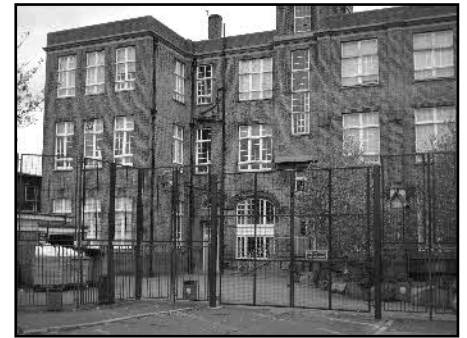
Tom Hood School

The closing date for responses is 2 nd February 2009 . You can write to Spatial Planning, London Borough of Waltham Forest, Sycamore House, Town Hall, E17 4JC, alternatively you can email your comments to LIPS@walthamforest.gov.uk